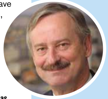
Commissioner for Transport, Siim Kallas