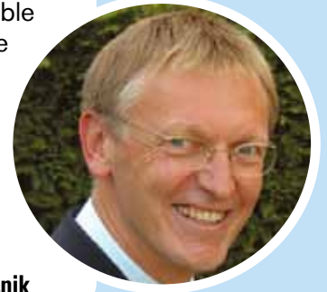
Commissioner for the Environment, Janez Potočnik